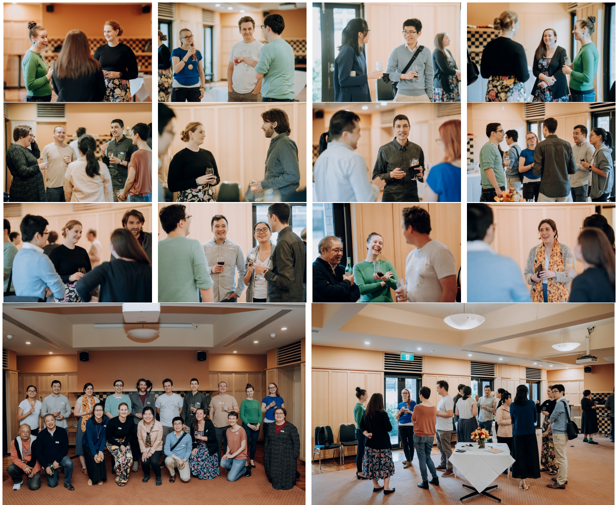
End-of-year social event