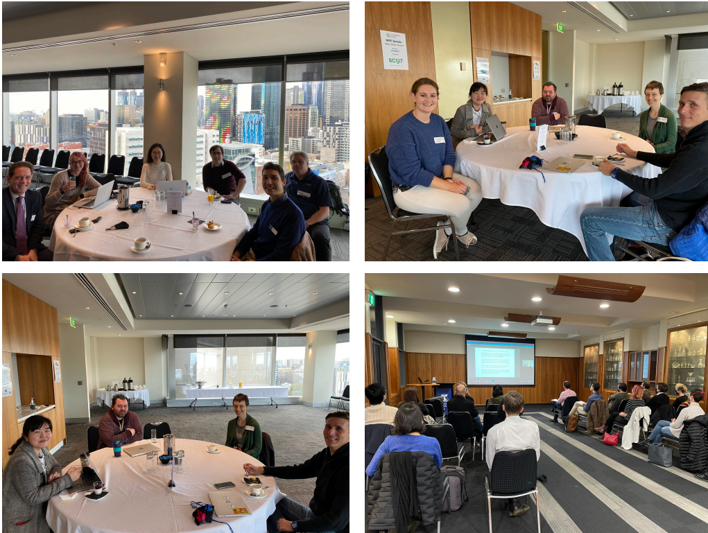
ANZSC Face-to-Face Victoria Hub and Foreman Lecture