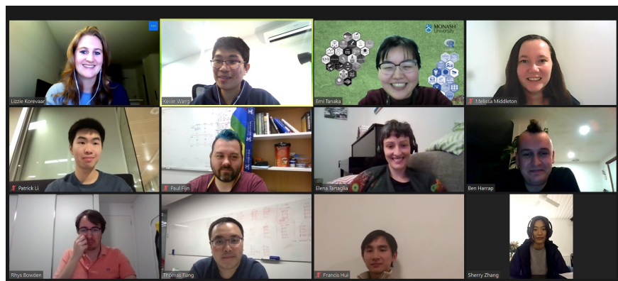
Online trivia with some interstate participants.