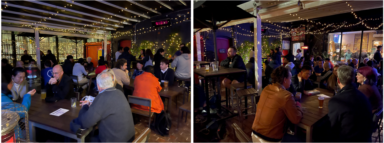
Our mentoring night featuring the mentors and mentees.